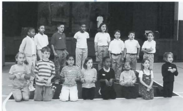
Virginia Opera's presentation of "The Pied Piper of Hamelin" included many Potomac students.