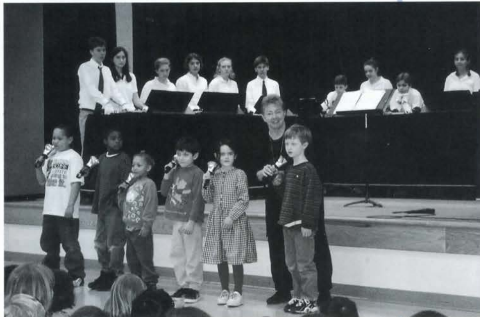
Coppers and Tins on Tour