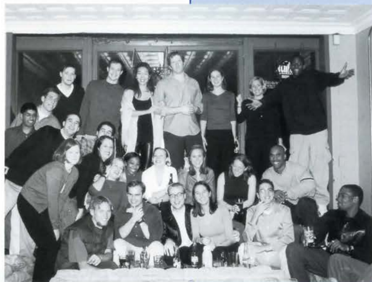
Members of the class of 1994 gathered for their 5th reunion this past Thanksgiving.