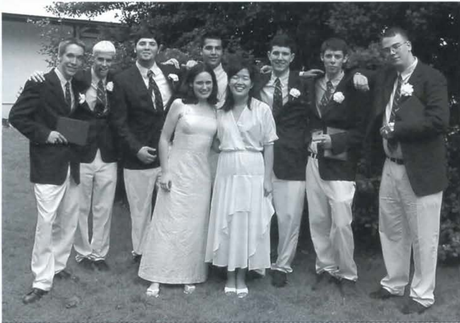
In the next Term: Graduation 2000 Pictured here: Senior Band members.