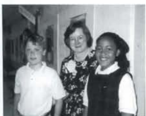
Grandparents' Day page 18