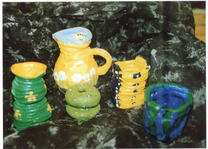
Selection of Middle School clay pottery