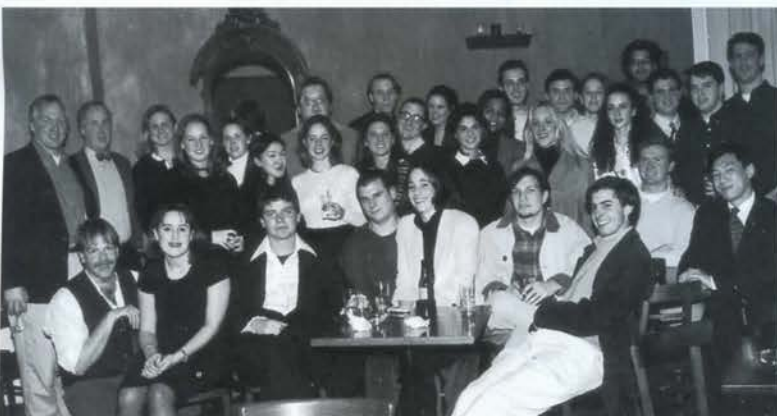
The first graduating class from Potomac's US gathered at Christmas to celebrate their 5th reunion in 1995.