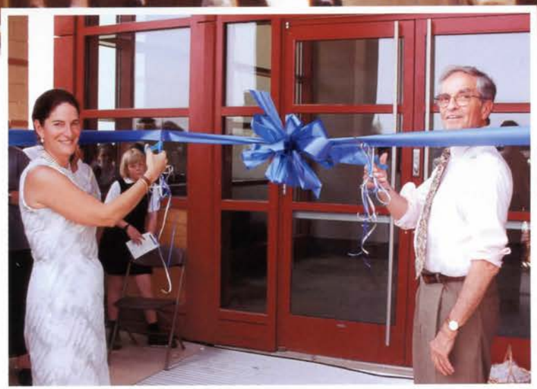
Dedication of the Engelhard Performing Arts Center