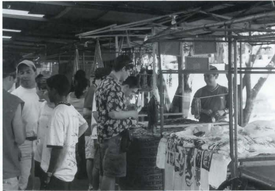
Marketplace in San Jose