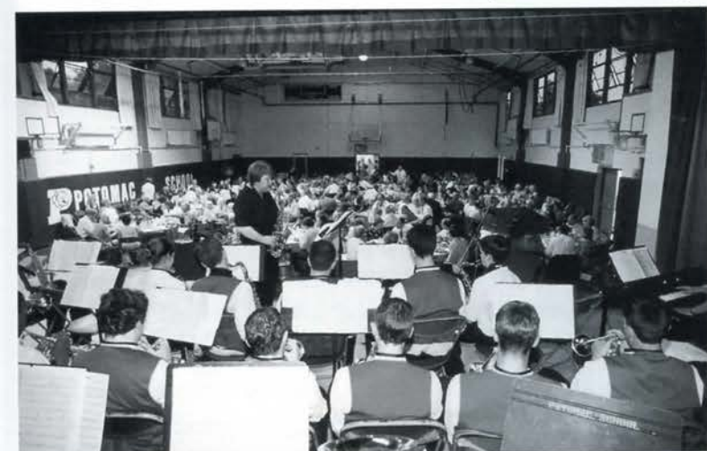
The Jazz Band played a musical selection for the dinner guests.