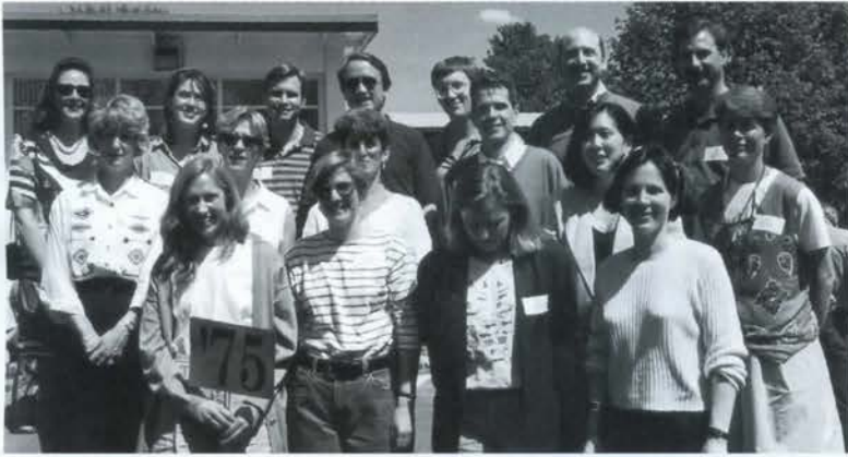
Classmates from the class of 1975 came back to Potomac for Reunion '95.