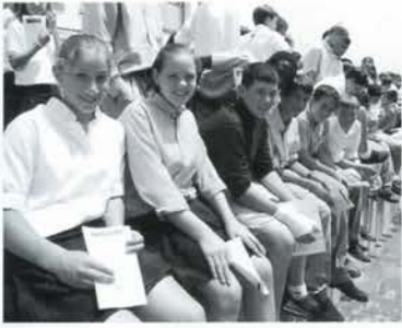
IS students find a comfortable place to sit.