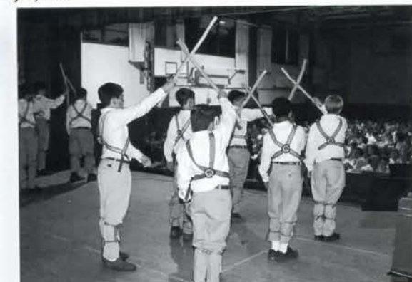
Morris Dancers made a grand entrance through the crowd and performed on stage.