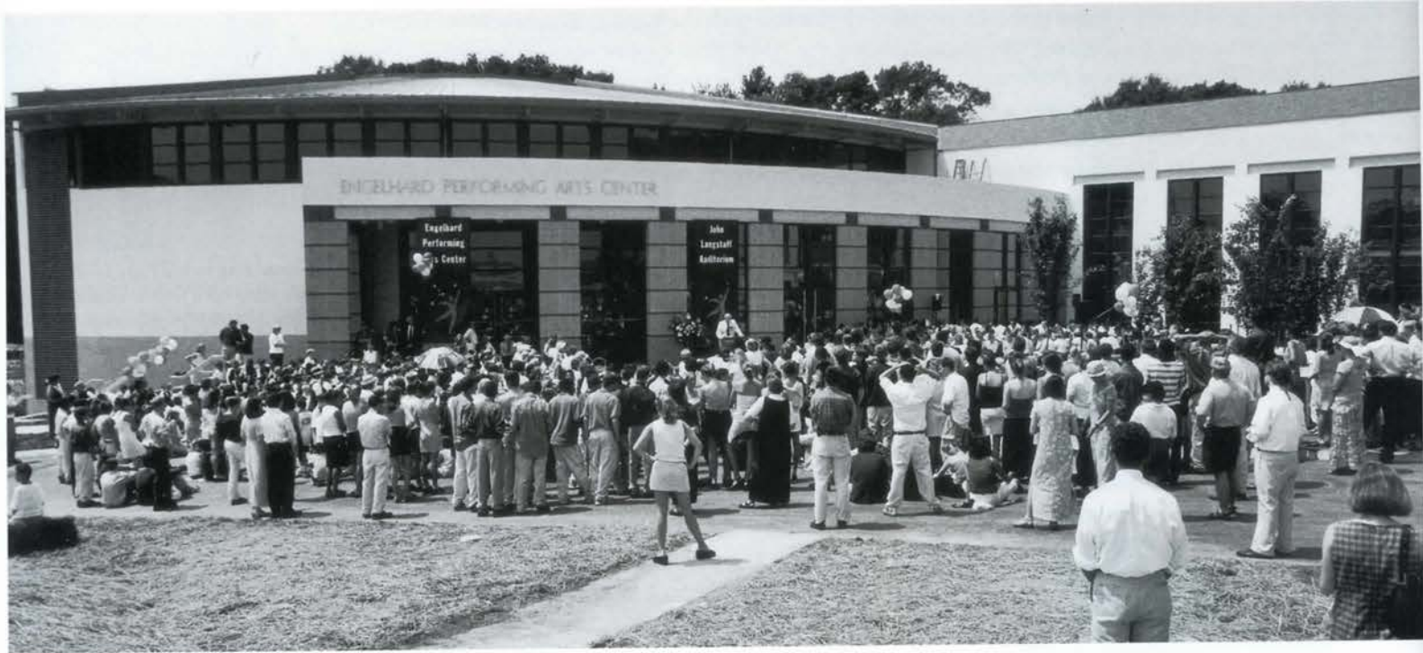
A spectacular crowd joined the Potomac School for the 2 p.m. dedication of the Engelhard Performing Arts Center.