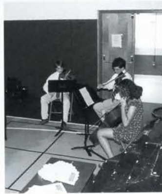
Intermediate students in the String Trio played Trio Sonata No. 3, by Pergolesi.