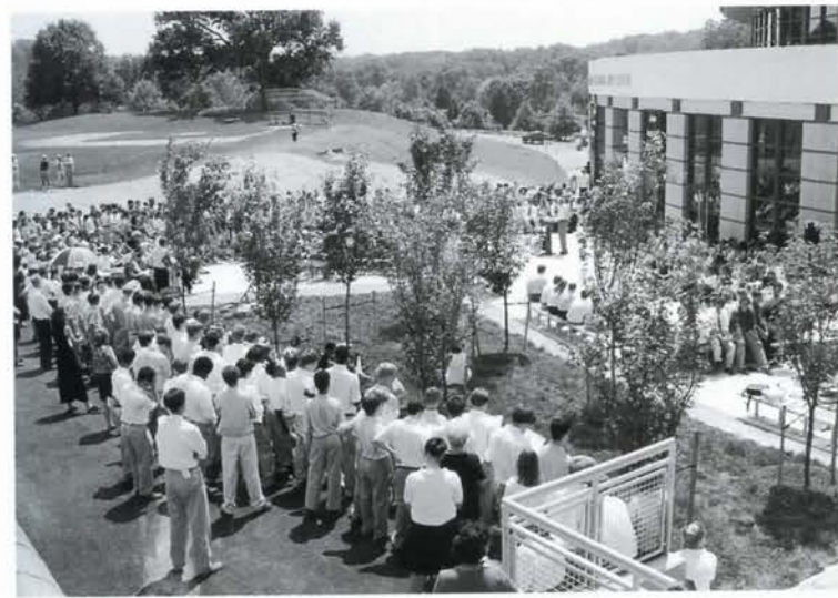
View from the bridge connecting the Intermediate School to the Performing Arts Center.