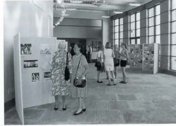
The lobby showcased a collection of photographs, posters, programs and other memorabilia from several decades of Potomac productions.