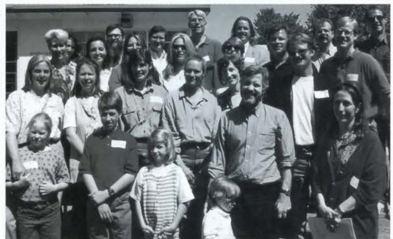
A great crowd from 1970 gathers for their 25th reunion in 1995!