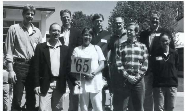
The class of '65 celebrates their 30 th Reunion in 1995.