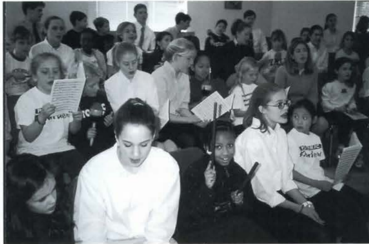
The IS chorus and second grade collaborate to make a joyful noise