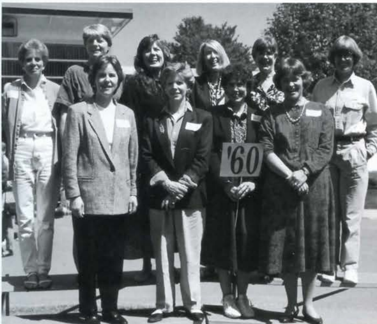
Members of the class of 1960 celebrate their 35th reunion in 1995.