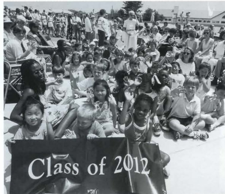
Lower School Kindergarten students display their class banner.