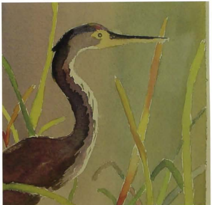
-Sima Jaafar '00