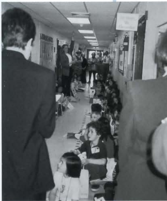
Here the Lower School hallway is transformed into the body of a jet taking the students to lands far and wide.