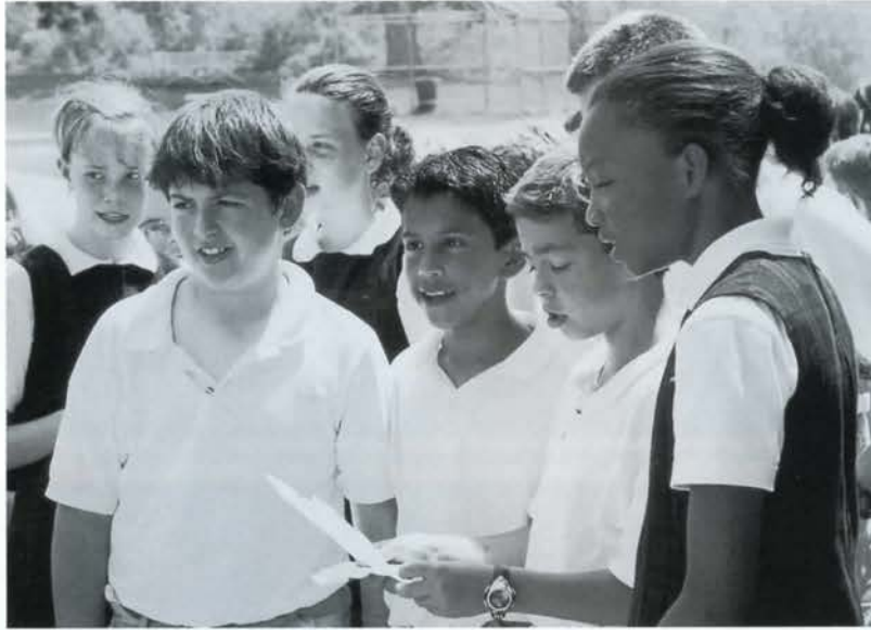
Above: Middle School students singing.