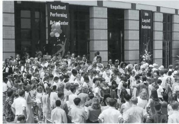
Middle School students played their recorders during the song "Simple Gifts."