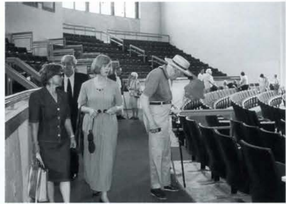
Special Guests and the Board of Trustees were invited to inspect the Performing Arts Center following the dedication.