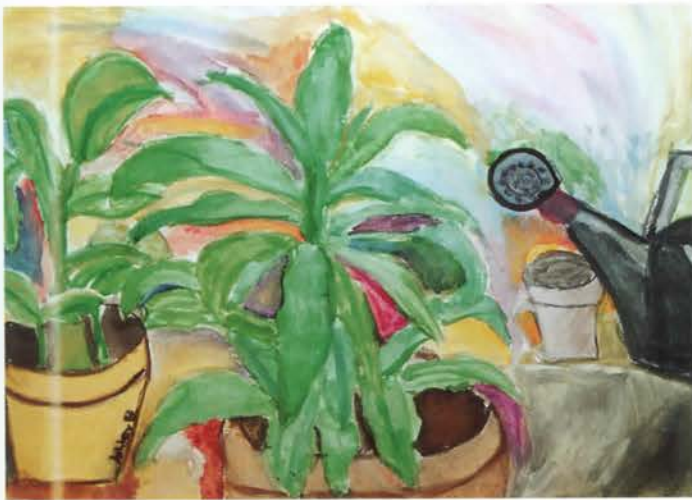
-Ashley Burnett '05