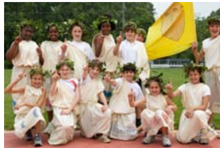
At the end of their study of ancient Greece, fifth graders participate in a festive day of Olympic events, Greek dancing, and ode reading.