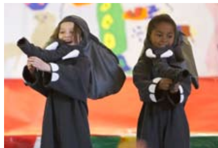
To the crowd's delight, the elephants at Kindergarten Circus decide to spray the spectators.