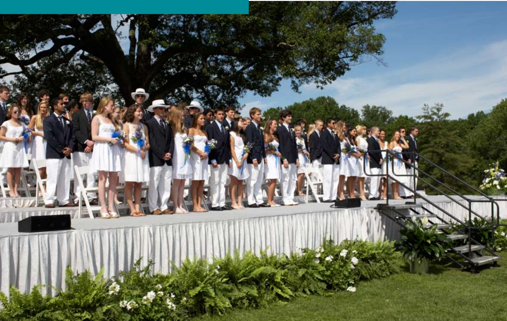
[above] The Class of 2008 arrives on the podium.