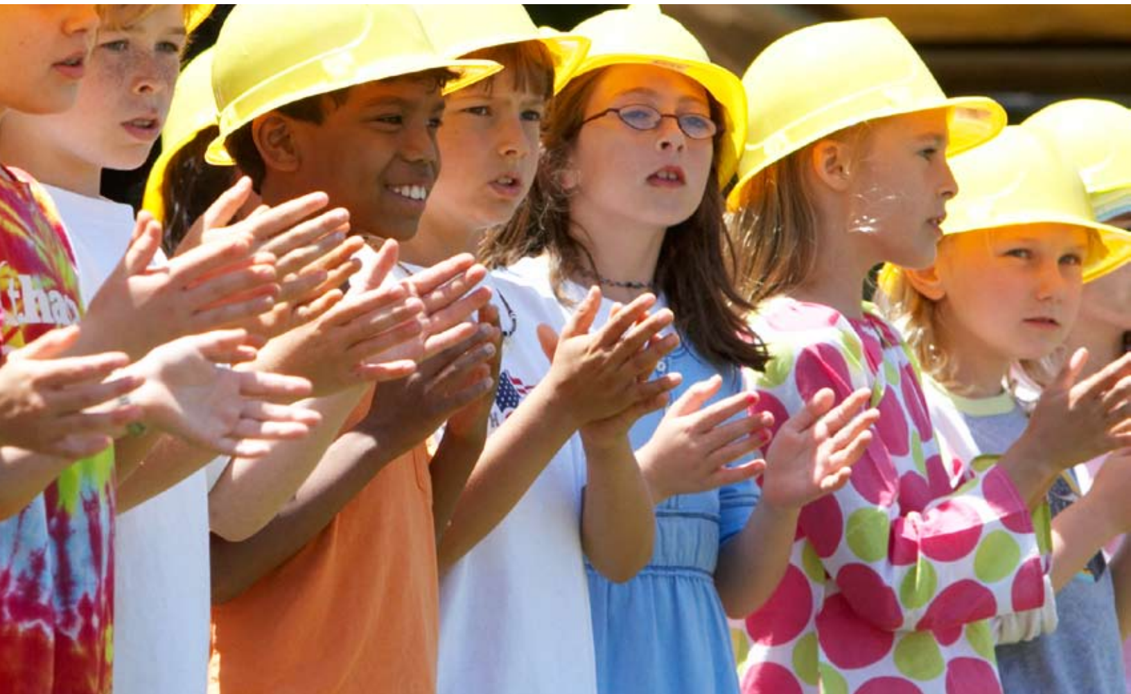
[top] Ready to work with those shovels.