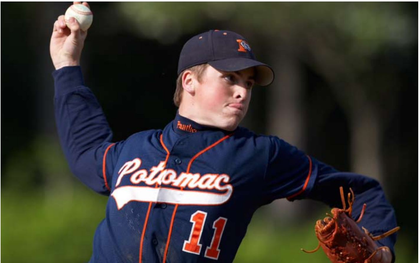
[top] Potomac teams emphasize mentoring between upperclassmen and their younger teammates.