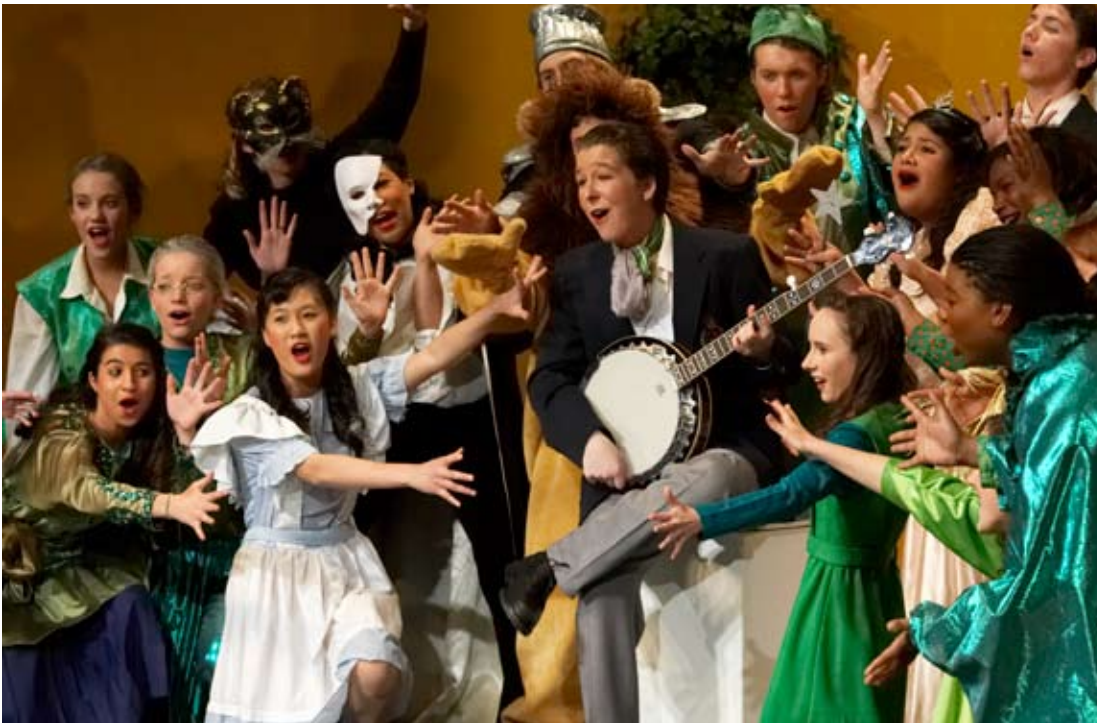
Andrew Lloyd Weber's rarely-performed comedy "By Jeeves" garnered rave reviews from the audiences attending the Upper School musical.