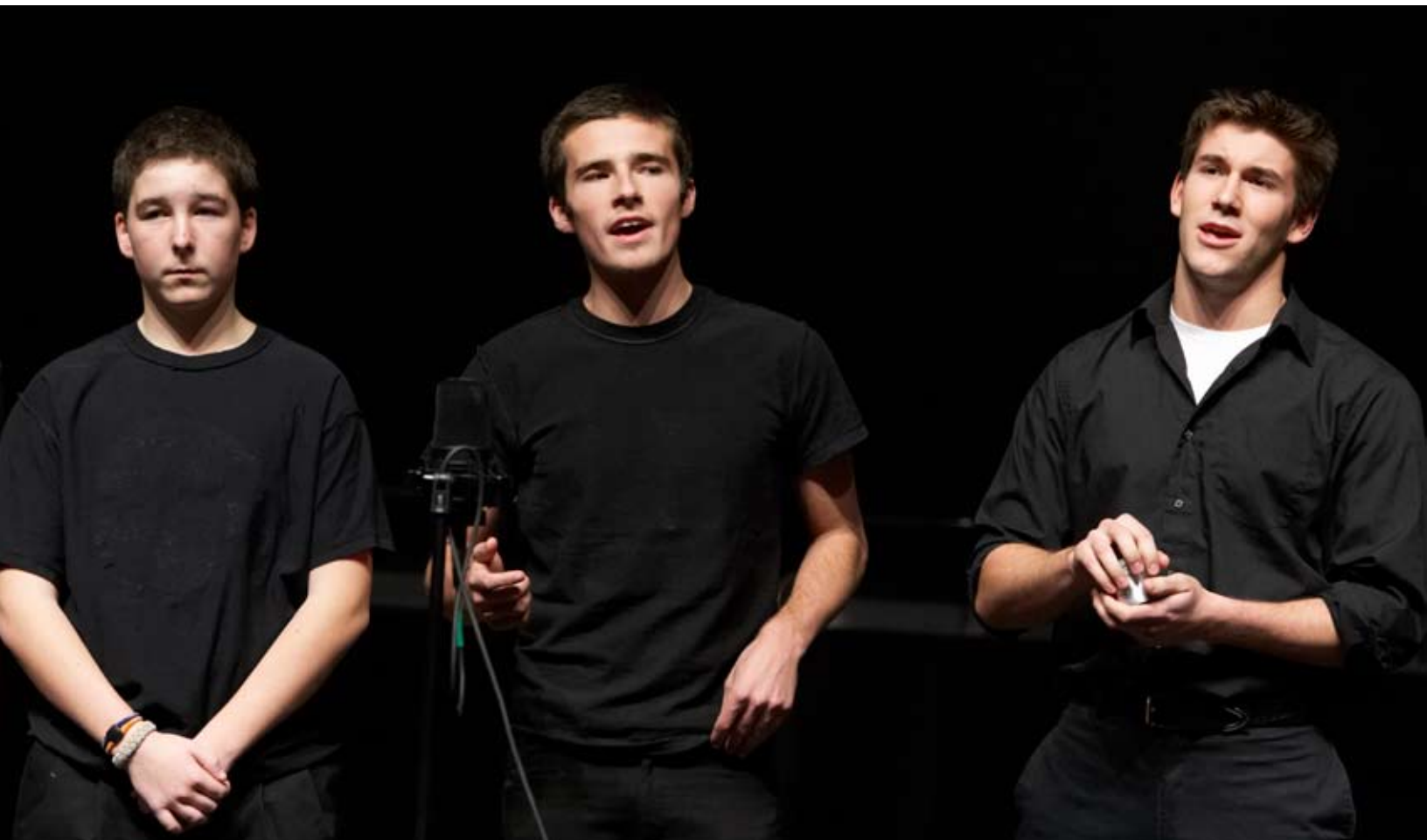
"I couldn't have done as well in the classroom or in music without what I learned on the football field."

[A] I've always been incredibly impressed by the quality of coaches at Potomac. I've never met a better group of coaches in one place. Each one has something to offer, and I've learned so many lessons from them. They've set important examples for me, teaching me how to work hard. You don't learn to work hard from doing homework.