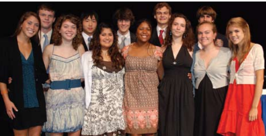
[above] missing caption