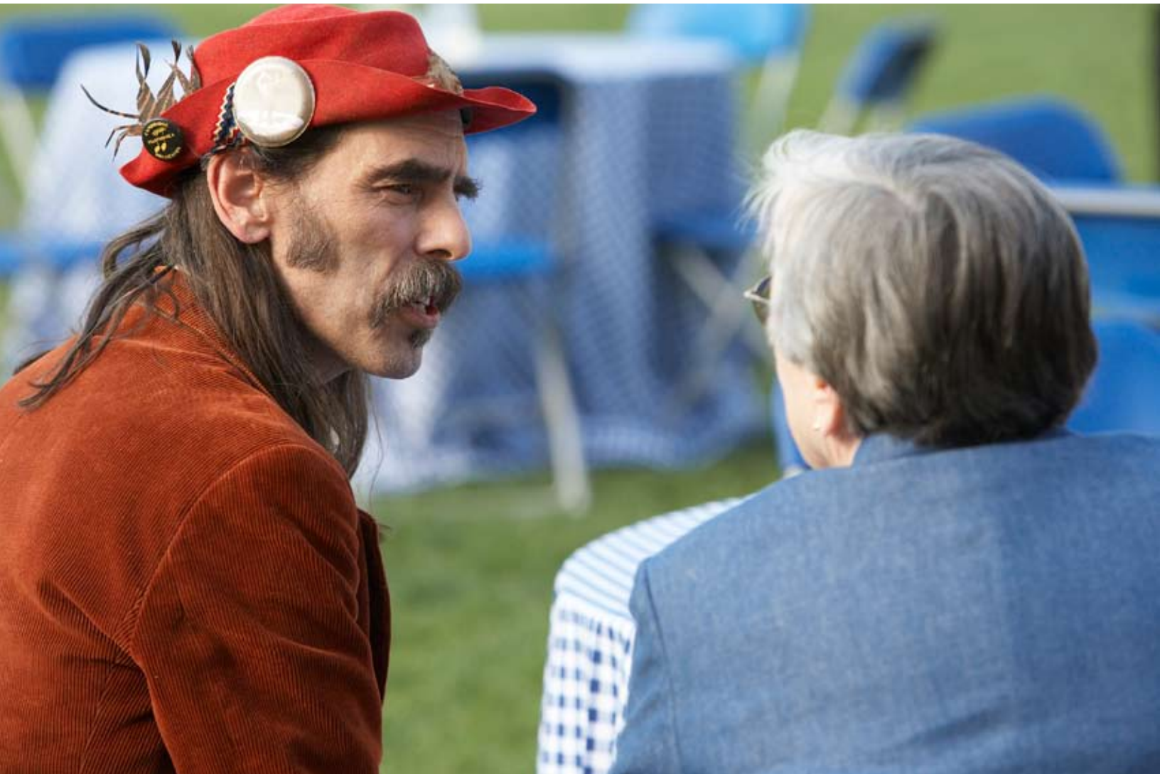
[left] Could we edit this caption so it is not a repeat of Reunion Barbeque