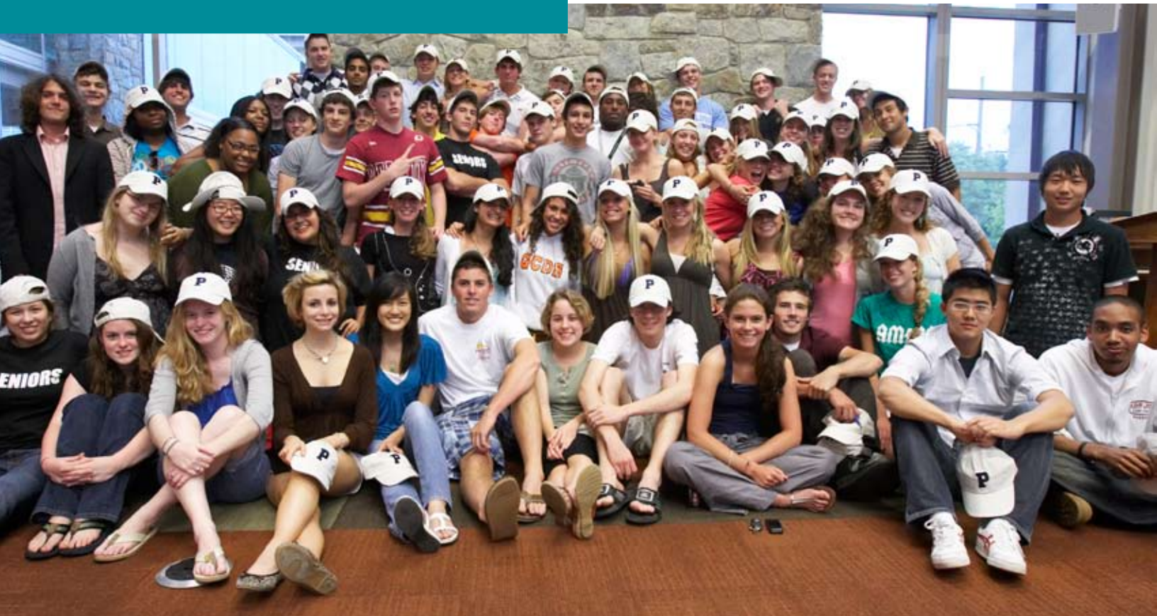
[above] Need Caption