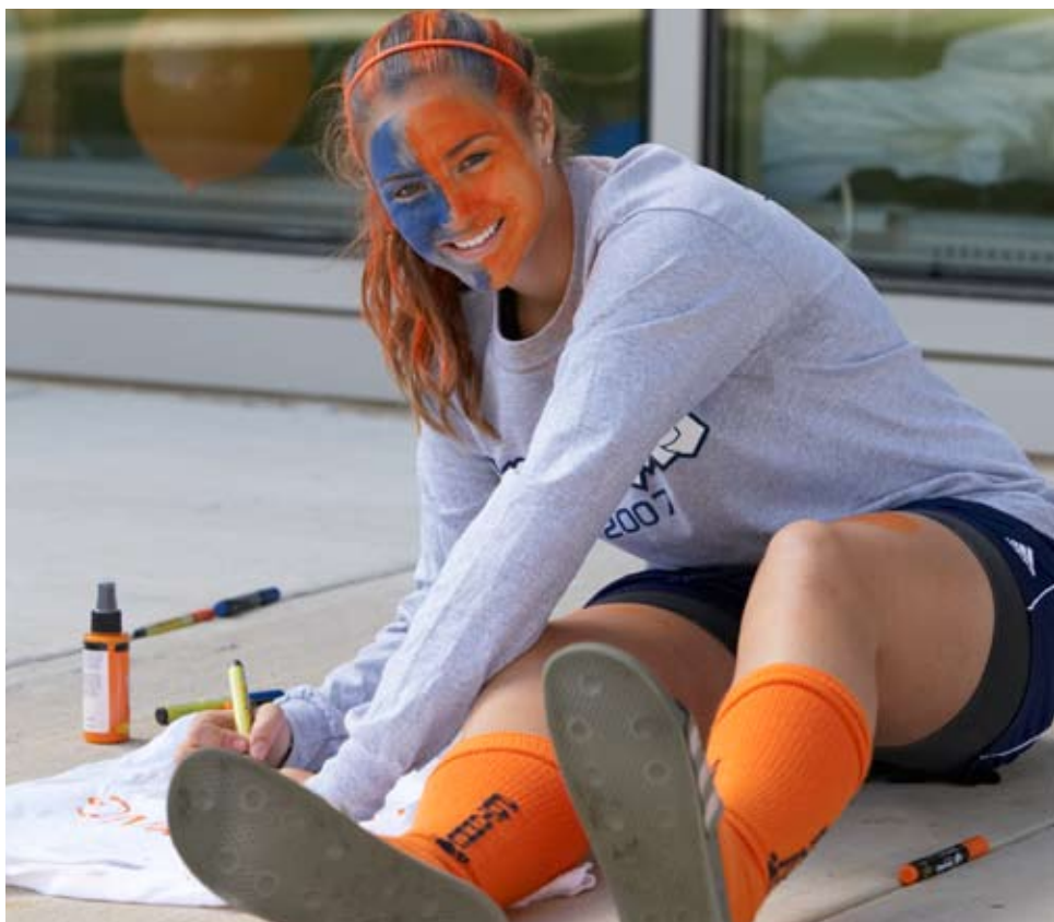
[left] Members of SAC encourage turnout at games and make sure everyone knows when a key game is being played.