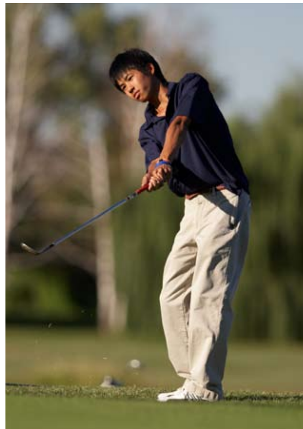
[right] Potomac offers 21 varsity sports played over three seasons.