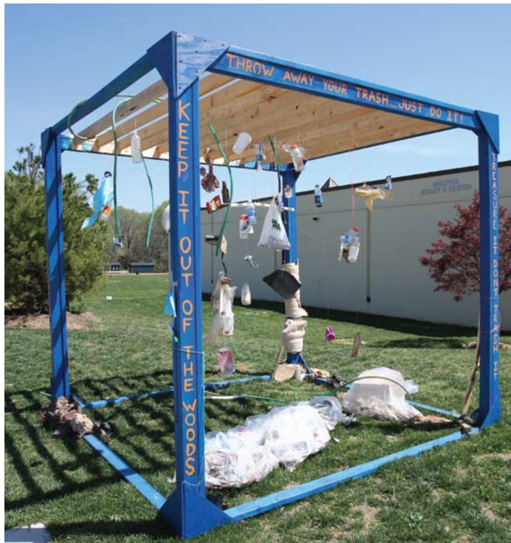
Students created a trash sculpture to draw attention to the problem of litter. Trash found on campus was attached to the frame.

As part of the two-week campaign, the Distinguished Speakers Series featured a talk by noted environmentalist Robert Kennedy, Jr. who