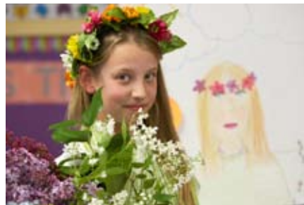
Gods and goddesses come alive in the hallways of Middle School as part of the fifth grade study of ancient Greece.