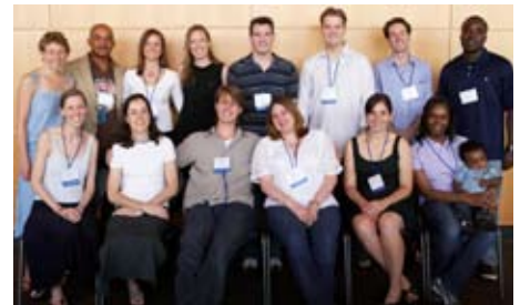
Class of 1997 at Reunion Weekend.