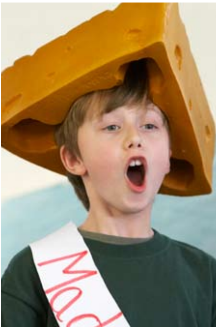
Third graders show off their knowledge of state capitals at a Lower School assembly.