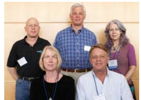
Class of 1967 at Reunion Weekend.