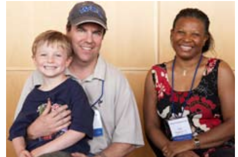
Class of 1978 at Reunion Weekend.