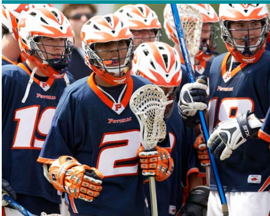
Accents of orange distinguish the Panthers from other teams in the area garbed in blue and white.

The addition of the color orange was approved and supported by both the administration and the student government. Over the past few years, as uniforms needed replacing, a consistent and contemporary Potomac look has evolved. The bold touch of orange has been phenomenally successful with students, who enjoy the Panthers' distinctive new style on the field.