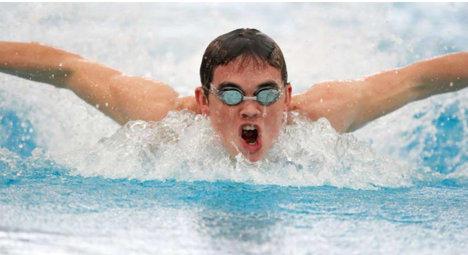
[above] Potomac's small size means more opportunity to compete at a younger age than students would have at a big high school.