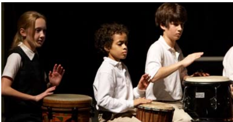
The MS Drum Club performs during the LS Black History Month assembly.