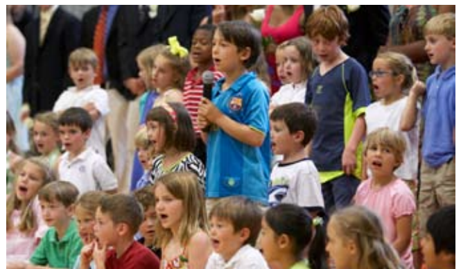
Kindergartners serenade Lifers at the Closing Assembly.