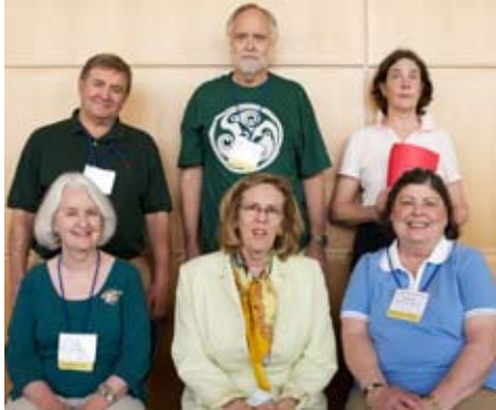
Class of 1958 at Reunion Weekend.