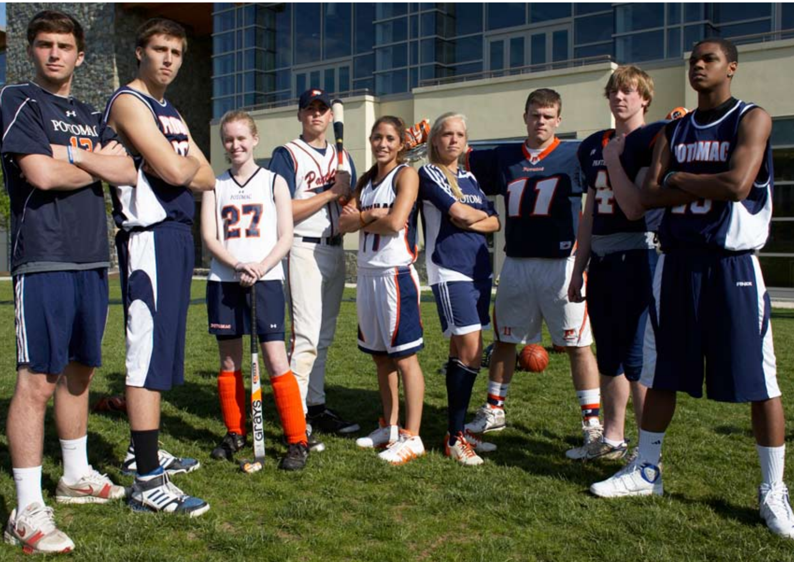
Girls teams compete in the Independent School League (ISL), while Potomac's boys are part of the Mid-Atlantic Conference (MAC).