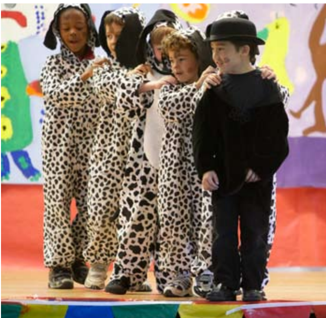
A conga line of puppies entertain spectators at the Kindergarten Circus.