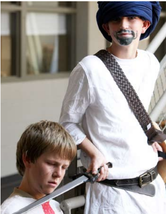
Sixth graders portrayed their favorite characters from the Middle Ages at the Medieval Bazaar.