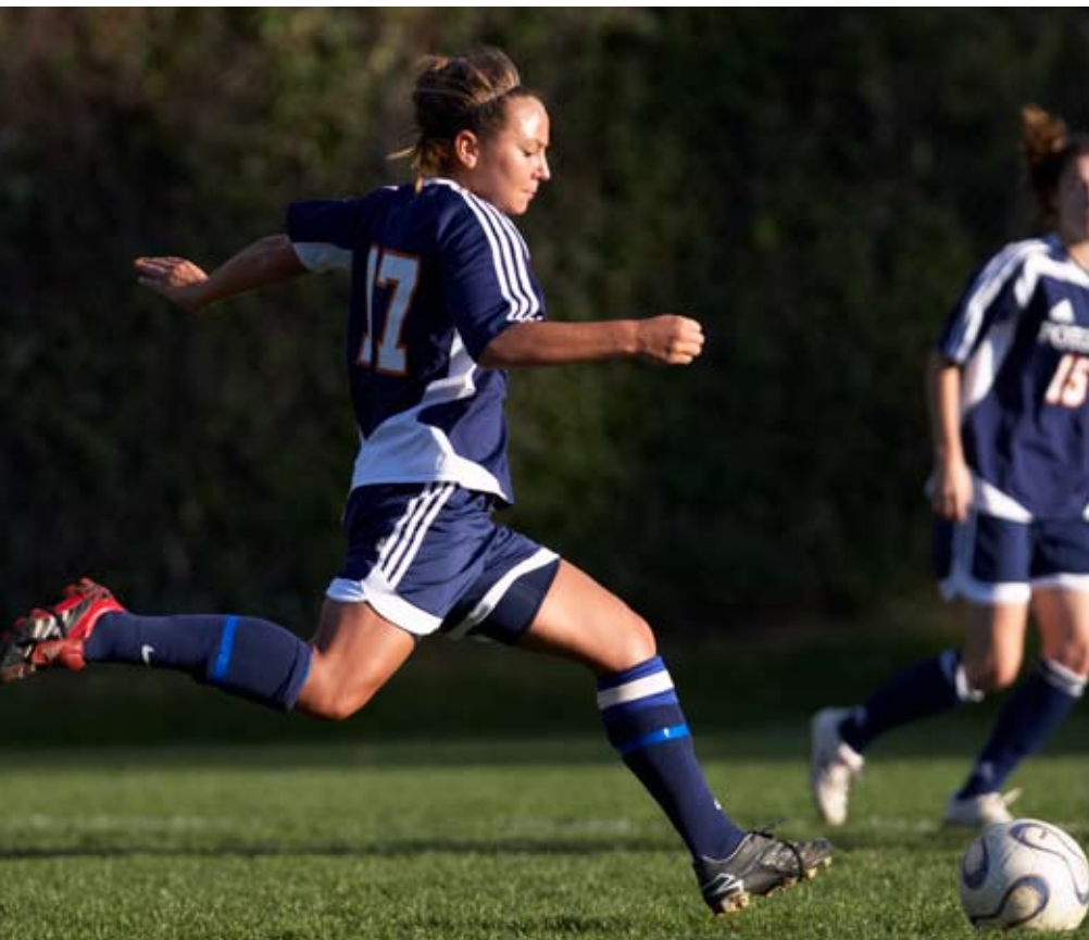
[left] Values like hard work and teamwork are invaluable on the field and in the classroom.

Potomac deliberately designed a unique leadership structure that puts programs for both genders on an equal footing. We are among the