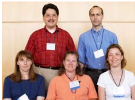
Class of 1977 at Reunion Weekend.