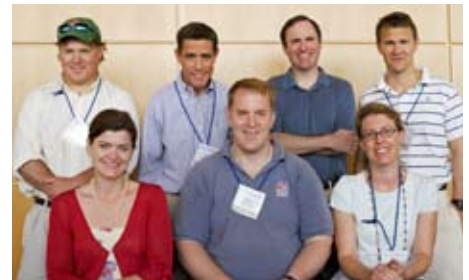
Class of 1982 at Reunion Weekend