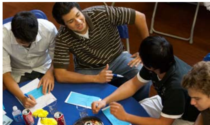
[above] Need Caption