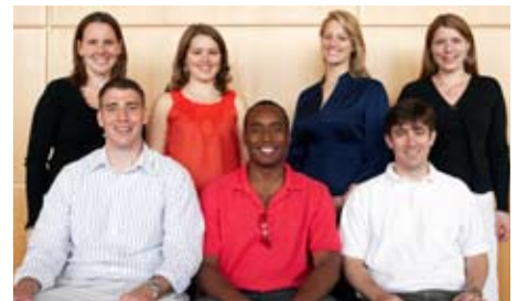
Class of 1998 at Reunion Weekend.