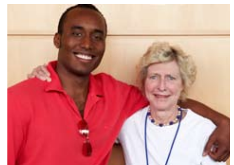
Class of 1952 at Reunion Weekend.