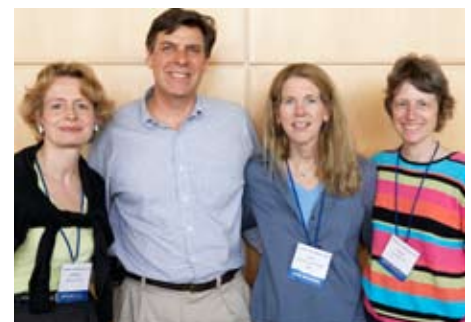
Class of 1968 at Reunion Weekend.