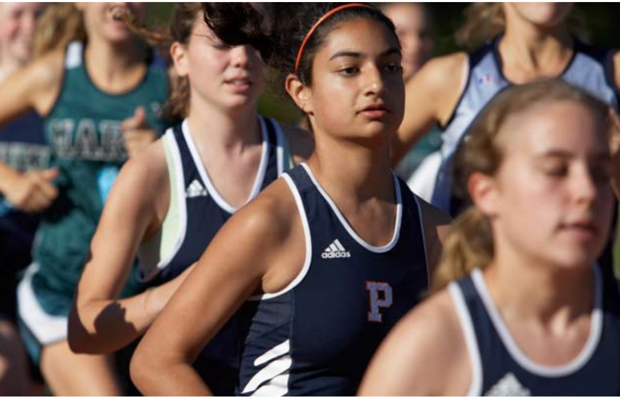
[left] Potomac is recognized across the state for its strong running program. Our athletes have captured conference and state titles in cross country, indoor track and field, and outdoor track and field.