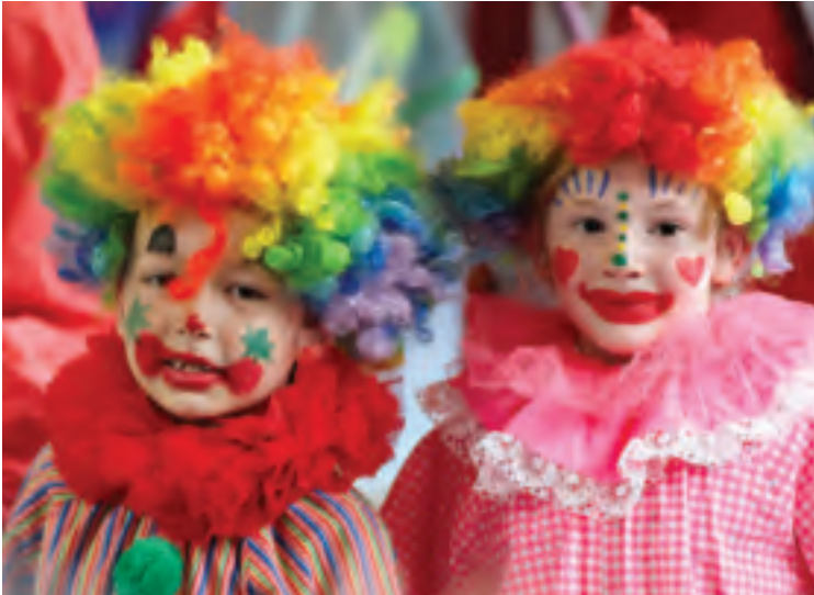
Clowns charm the crowd at the Kindergarten Circus.