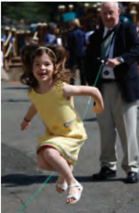
The older generation joins in the fun at the annual Grandparents Day celebration.