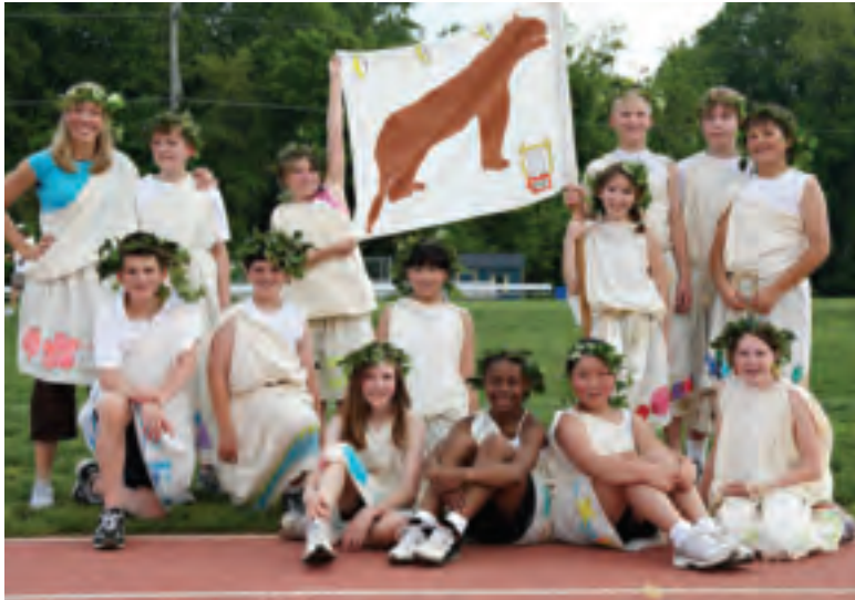
The winning City-State at the fifth grade Greek Olympics poses with their flag.