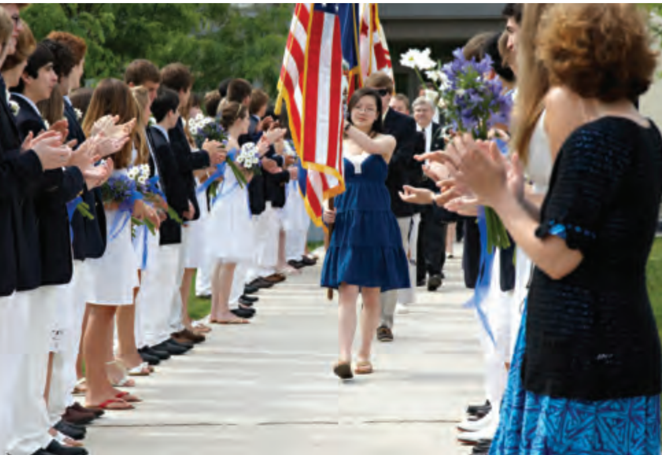
Graduating seniors applaud as the faculty procession begins.