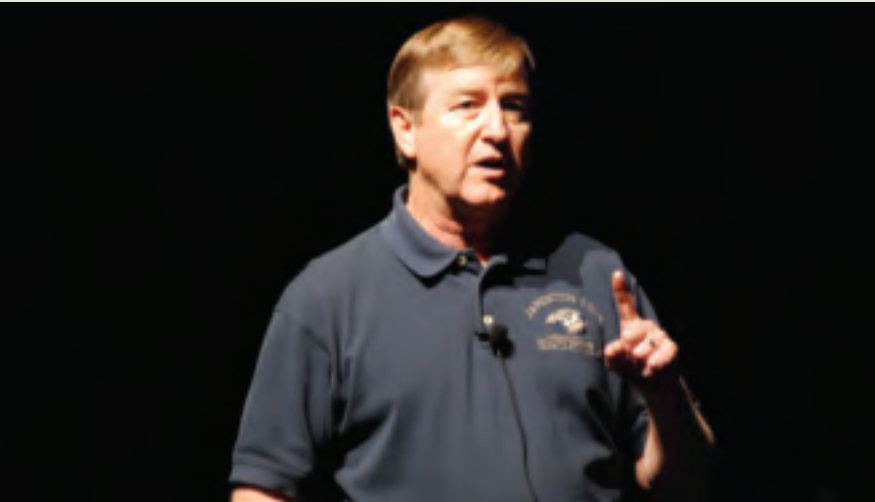
Astronaut Frank Culbertson, Jr., shared his experiences with Potomac students in May as part of the Distinguished Speaker Series.

Potomac students were treated to an outstanding lineup of special lectures during the 2008-2009 school year through the annual Distinguished Speaker Series. Organized by the Parent Association, the series supports the school's mission to foster each student's intellectual development by engaging students in a broad range of viewpoints and topics.