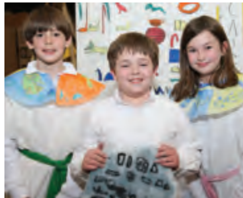
Fourth graders studying Egypt present their research projects at the annual Egyptopia celebration.