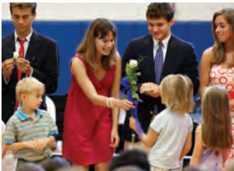
Class of 2009 Lifers receive roses from kindergartners during Closing Assembly.