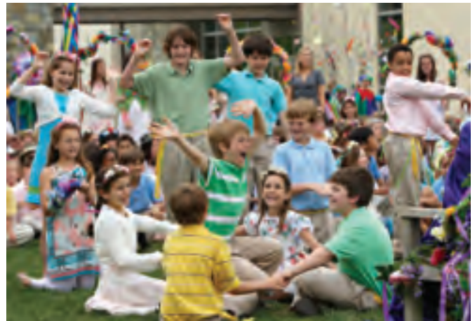
Dancers delight in their performances as part of May Day festivities.