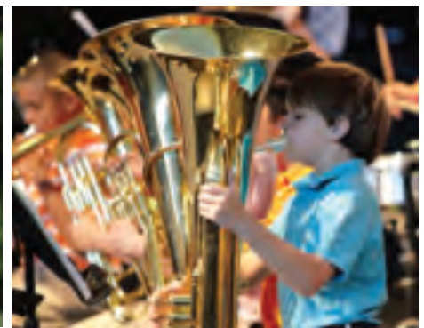
The Middle School concert brings out enthusiastic musicians.