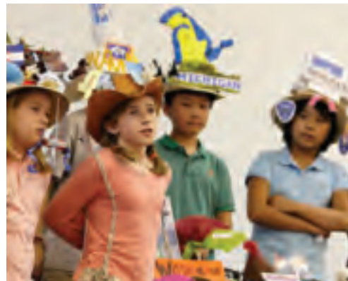
Third graders show off their knowledge of state capitals at a Lower School assembly.