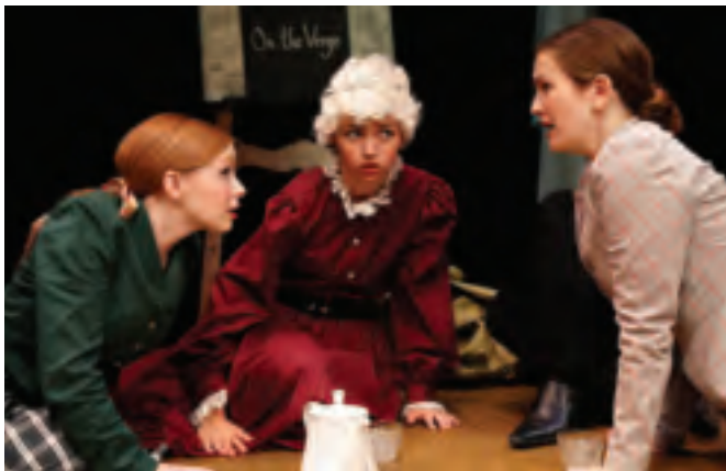
The Upper School play, "On the Verge or The Geography of Yearning," was a big hit in May.