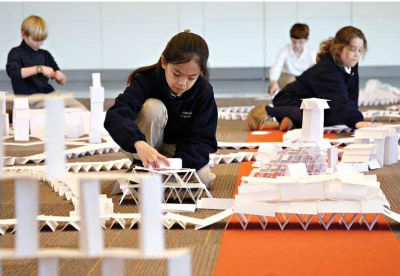
Silently and using only their hands, fourth grade students build a paper city stretching across Ramsey Assembly. The team constructed roads, skyscrapers, swimming pools, a football stadium, and an "Alcatraz"-esque jail.