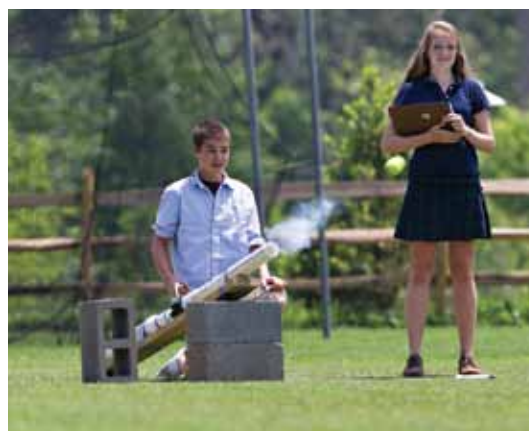
Top: Red-Blue Day featured its usual tug-of-war battles and enthusiastic cheering sections. Far left, Middle Schoolers compete in the Greek Olympics. Left, Lower and Middle Schoolers demonstrate their skills at the annual Jump Rope for Heart Assembly. Above, Intermediate School science students study propulsion by building pneumatic launchers and experimenting with the effects of angle and pressure on the distance tennis balls will travel.