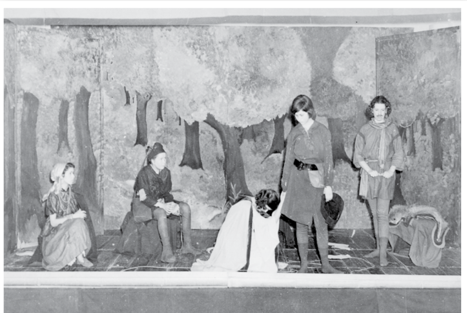
From the archives: The Class of 1937 performs.