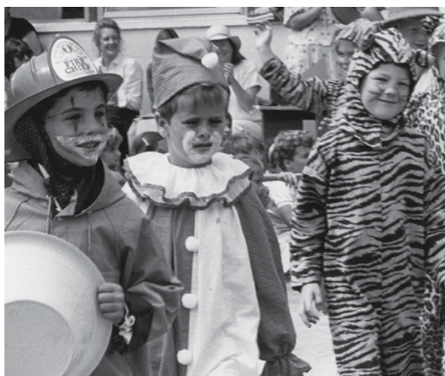
From the archives: Kindergarten Circus in 1986.