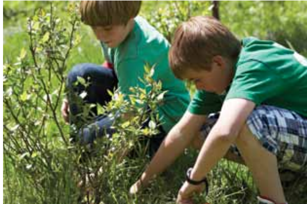
Students plant bushes as part of the Earth Day celebration on campus.

Students in all divisions worked hard on Earth Day this year to beautify the campus as well as learn about and promote environmental responsibility. First