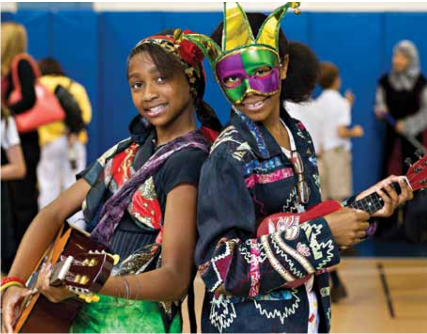
Opposite page: Middle School garland girls perform as part of the traditional May Day festivities. Left, minstrels in costume at the Middle School Medieval Bazaar. Below, Upper and Lower School students enjoy time together in Assembly.