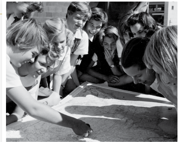
From the archives: The Class of 1957 at an outdoor science class.

Seen as emblematic of Potomac's strong connection to the outdoors, Potomac's nature trails hold an important place in the hearts of students, alumni and faculty alike. Throughout the decades since the School moved out of the city to McLean, teachers have incorporated the natural resources of the campus into the curriculum. Teacher Dur Morton established the trails among the ponds and streams of Potomac's forested campus during the 1950s, and they remain a valued retreat, educational treasure and important natural legacy to nurture and protect. Generations of students have captured tadpoles and turtles and dragonflies, built dams and bridges, and cleared and cared for the land they consider part of their Potomac education. In recent years, increased grants and funding have brought new attention to the stewardship of the land, resulting in improved trails and bridges, a resurgence of healthy, native species, the building and use of outdoor classrooms, and a regular community effort to clean up litter and plant trees and shrubs throughout Potomac's beautiful 90 acres.