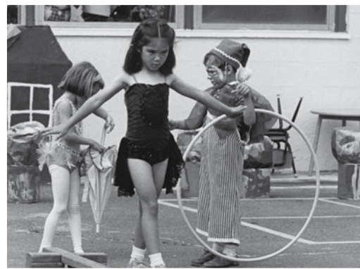
From the archives: Kindergarten Circus in 1986.