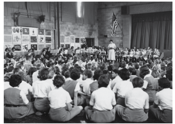
From the archives: Assembly in 1961.

Each time all four divisions gather for Opening Day, Thanksgiving and Closing Day Assemblies, the entire School is strengthened. And the regular weekly Assemblies within divisions pull the various classrooms together so often that the group experience becomes an integral part of each student's education. Students gain confidence as valued and contributing members of the School community. They learn to appreciate diverse viewpoints and to interact in a kind and generous way.