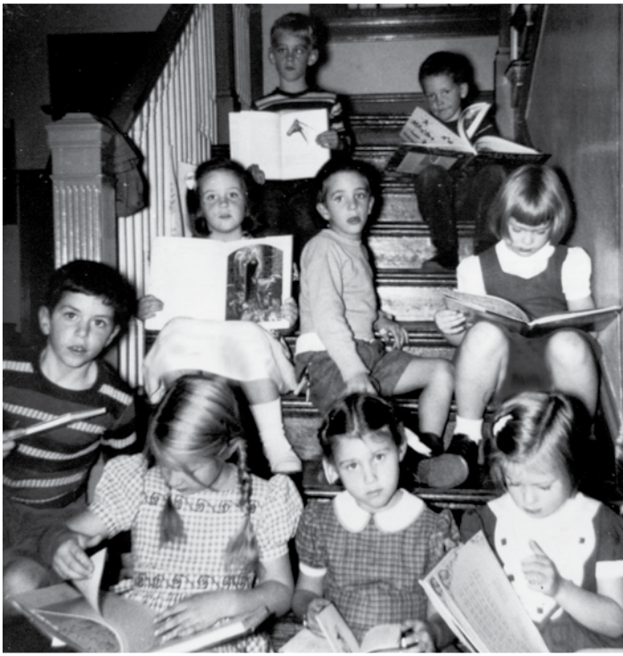
From the archives: The Class of 1959 after Book Fair.

Potomac instills in its students a love of reading and nourishes this love through such traditions as Book Fair. Initiated in the 1960s, Book Fair was originally held in the Middle School Square and offered new, hardcover books for children delivered by the Francis Scott Key bookstore. Today Book Fair extends across the Lower and Middle Schools and includes new books and thousands of used volumes donated by the entire community. Last year students collected and donated nearly 20,000 books for the Fair. One highlight for students is their official class visit, a chance to buy any books they choose. Another is “bag day,” the last day of the sale when customers can bring home an entire bag of books for two dollars. Four years ago a Cultural and Community Night was added to the festivities; Potomac families are invited to share their heritage including music, poetry, art, cuisine and dress. Proceeds from the Book Fair are an important source of support for Potomac’s libraries.