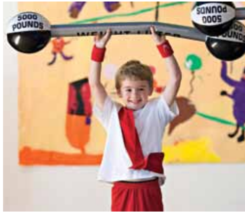
Far left, Lower Schoolers dressed in costume for Colonial Day as part of their studies of Colonial times. Near left, a strongman at the Kindergarten Circus.