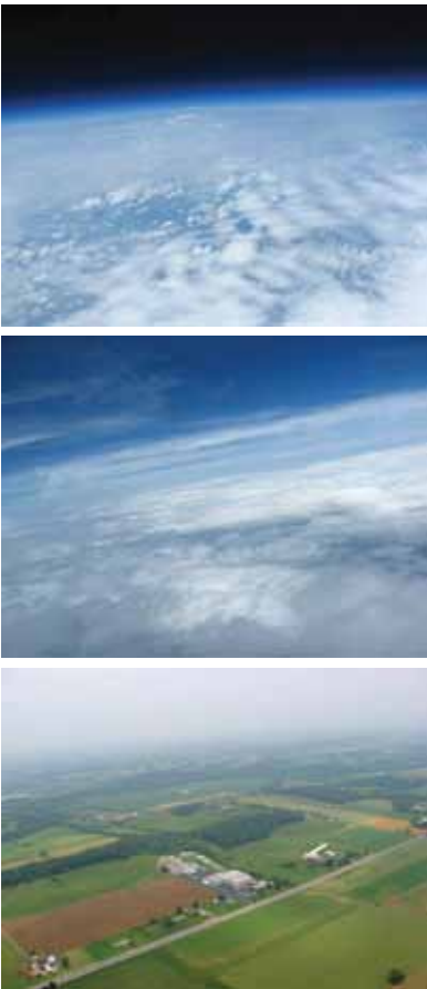
A camera sent into space by Intermediate School students returned with many beautiful images.

Using a weather balloon to send a camera 20 miles above the Earth, Intermediate School students captured stunning images and video of the curve of the Earth's atmosphere dissipating into the blackness of space.