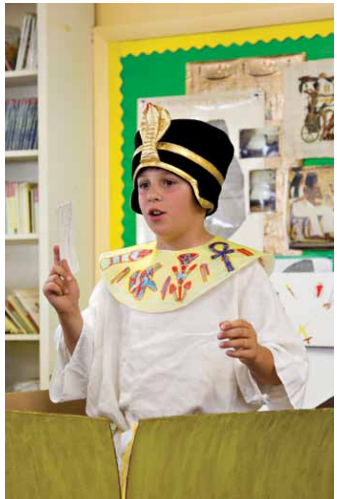
Top: A proud grandmother spends a morning at school for the annual Grandparents Day. Above, third graders show off their projects for Science Fair. Right, a student presents what he has learned about Egypt.