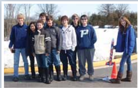
The Upper School Science and Engineering Club designed, built and tested model rockets as part of a national contest.

design, build and test a model rocket, with the goal of reaching a particular altitude and flight duration with a certain payload as set by this year's contest rules. The Potomac students constructed and launched two rockets on a total of 11 flights with an egg as cargo. Nine times they successfully carried the egg to altitudes of 500 to 750 feet and returned the undamaged egg to the ground. Though the team didn't make the contest finals, the group learned valuable lessons and plans to compete again next year.