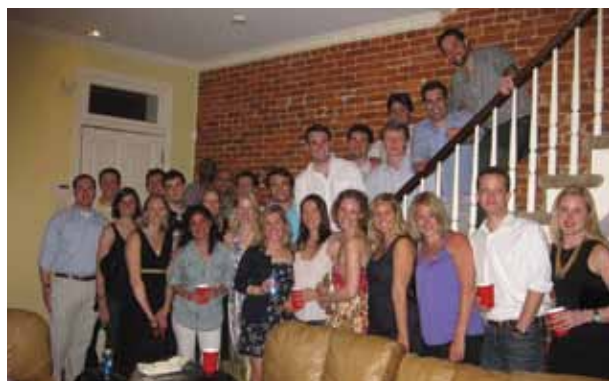
Class of '99 at the 2010 Reunion in May.