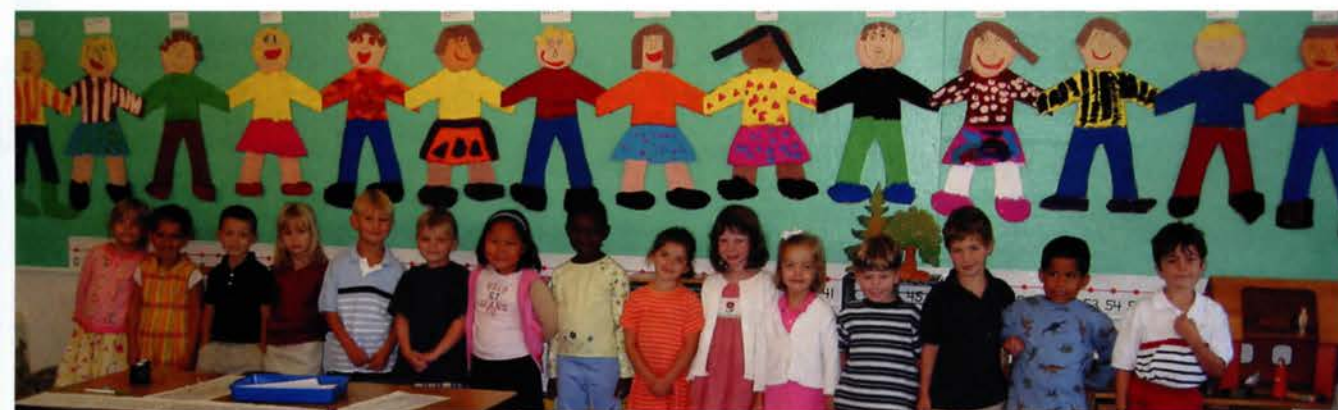
Lower School students pose with self-portraits they created.

David Macaulay, Caldecott-winning author and illustrator of over 15 books including Cathedral and The Way Things Work , spent a November morning explaining the creation of his new book, Mosque , to a rapt audience of sixth graders. After the attacks on the World Trade Center and the Pentagon, Macaulay decided to revive an abandoned companion piece to his architecture books of the seventies. This project, an examination of the construction of a fictional Turkish mosque, was intended as a way to appreciate the similarities between people. Macaulay used slides of original sketches, miniature models, and photographs to trace the evolution of this latest work. In the course of an hour-long journey to 16th century Istanbul, students learned a variety of facts, including: the tradition of the kibia, the imaginary line used to orient all mosques towards the holy city of Mecca, and the architectural challenges of building a dome. After his presentation Macaulay answered questions and signed books for the lucky sixth graders.