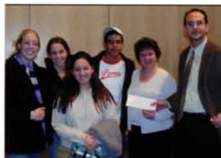
Alternative House, an Upper School community service project, were the beneficiaries of the proceeds raised at this year's holiday pie sale.