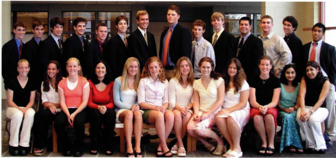
The Class of 2004 has 26 lifers, students who have attended The Potomac School continuously since kindergarten. See name listing on page 35.