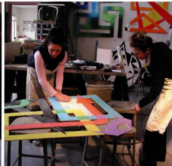
The Potomac School art programs provide students with an opportunity to use and experiment with a wide variety of mediums. Samples on this page include Lower School cut paper collages as well as Middle and Intermediate School projects done with paints and/or pastels. Upper school art students are shown creating wall sculptures using designs cut from thick cardboard and applied pastel coloring.