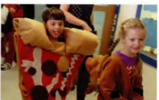
Lower School students paraded in their Halloween costumes.