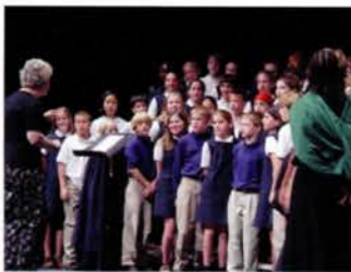
Middle School students enjoy singing for family and friends at assembly.