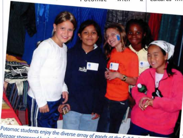
Potomac students enjoy the diverse array of goods at the Fall Frolics International Bazaar sponsored by the Parent Diversity Committee.

another example, whereas welcoming schools project a "positive image" about people of color or minority religions, etc. but still present it as 'us' studying about 'them', transforming schools "challenge racism and other isms—when looking at the experiences of [minorities] that have been historically marginalized". A last example: at welcoming schools, recruitment efforts are aimed at increasing the number of minority students at the school, but at transforming schools, recruitment efforts are aimed at families of all colors and cultures who are fully committed to diversity.