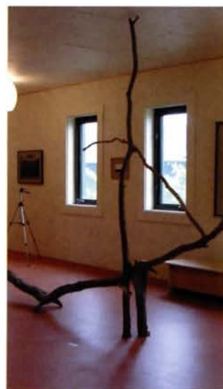
Interior sculpture created with natural materials